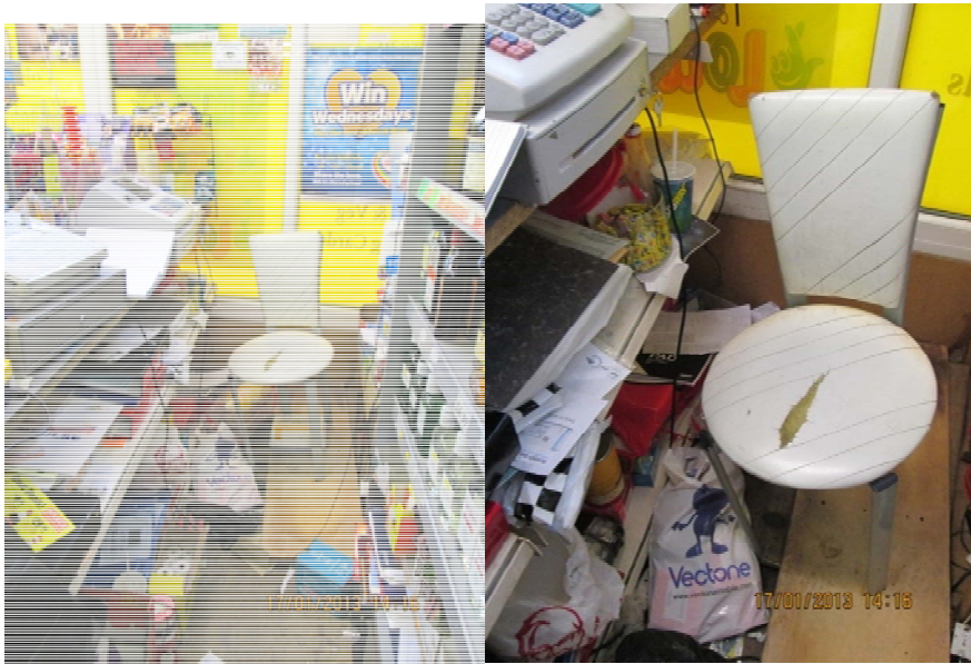
3) Cluttered work area and blocked cellar entrance.